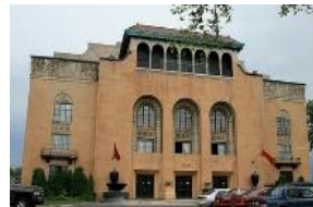
E. Eagles Club Built: 1924 Designation: National and Local