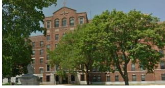
P. Milwaukee Hospital Built: 1912 Designation: National