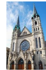
H. Gesu Catholic Church Built: 1893 Designation: National and Local