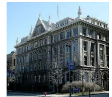
I. Johnston Hall Built: 1906 Designation: National