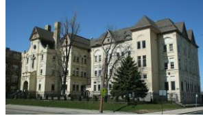
O. Milwaukee Normal School Built: 1885 Designation: National