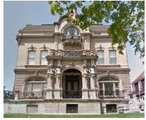
A. Joseph B. Kalvelage House Built: 1896-1898 Designation: National

www.historicmilwaukee.org facebook.com/historicmilwaukee @HistoricMKE