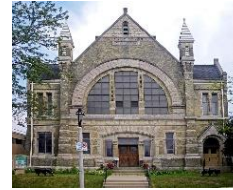
F. Grand Ave Congregational Church Built: 1887 Designation: National and Local