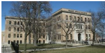
D. Milwaukee County Dispensary and Emergency Hospital Built: 1927 Designation: National