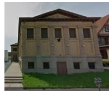
J. Kilbourn Masonic Temple Built: 1911 Designation: National