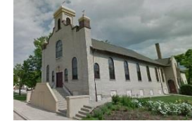
M. St. George Melkite Catholic Church Built: 1917 Designation: National