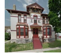
N. Thomas Cook House Built: 1875 Designation: National