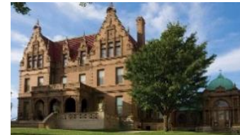
G. Frederick Pabst Mansion Built: 1890-1892 Designation: National and Local