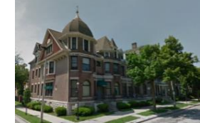
L. Kilbourn Avenue Row House District Built: 1870-1924 Designation: National