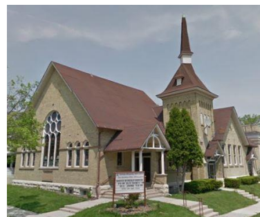
C Bethel Evangelical Church Built: 1897 & 1926 Designation: City Site