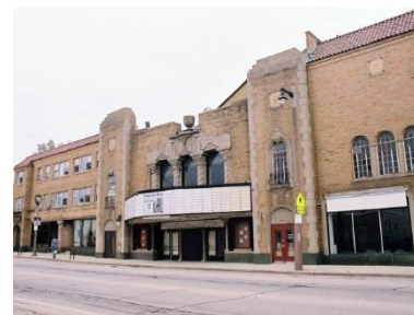
D Avalon Theater Built: 1926-29 Designation: City Site