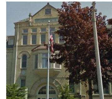
E Trowbridge St. School Built: 1894 & 1909 Designation: City Site