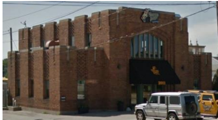
A Milwaukee F.D. High Pressure Pumping Station Built: 1931 Designation: National Site

www.historicmilwaukee.org facebook.com/historicmilwaukee @HistoricMKE