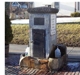
F Pryor Avenue Iron Well Built: 1882 Designation: City & National Site