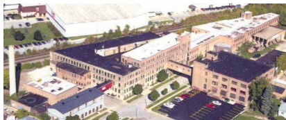
B Hide House Bldgs 1-4 (Greenebaum Tanning Co.) Built: 1898 Designation: City Site