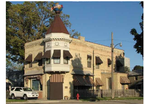
G Jos. Schlitz Brewery Co. Saloon Built: 1897 Designation: National Site