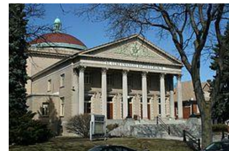
C. 2 nd Church of Christ Scientist Built: 1913 Designation: National