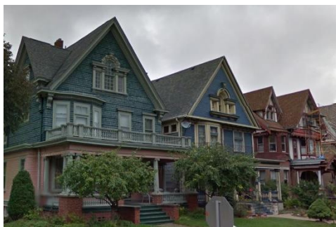
A. McKinley Boulevard District Designation: National