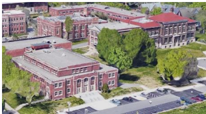
B. Concordia District Built: 1850 - 1930 Designation: Nat'l & Local