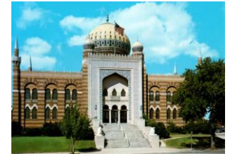
I. Tripoli Temple Built: 1926 Designation: National

Images from Google Street View and Wikipedia