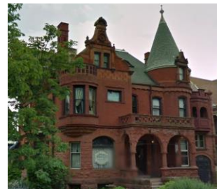
E. George Schuster House Built: 1891 Designation: Nat'l & Local