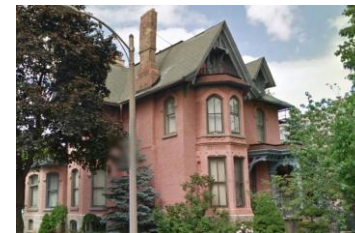
F. Harry B. Walker House Built: 1878 Designation: National