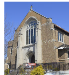
Event HQ & Lecture Location