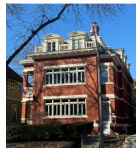
Upper Unit Only