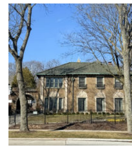
Ground Floor Only